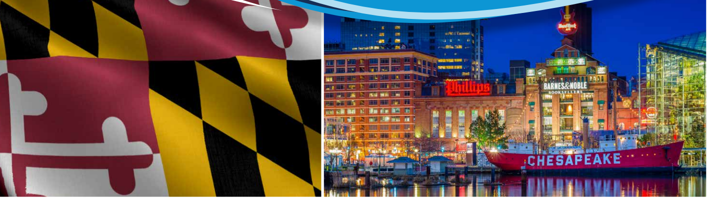
INNOVATE, CONNECT, PROTECT: THE FUTURE OF LAW ENFORCEMENT