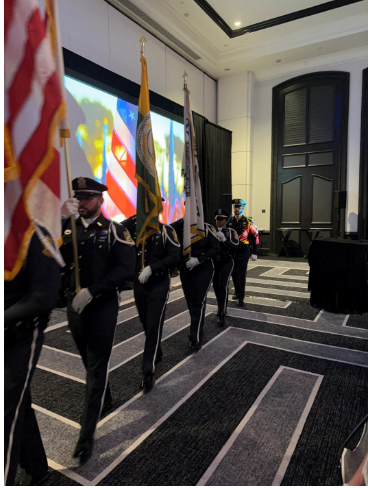
Florida FBINAA Conference in Miami Beach

The Florida Conference held in Miami Beach, Florida was a huge success. There were educational sessions and opportunities for both networking and fellowship.