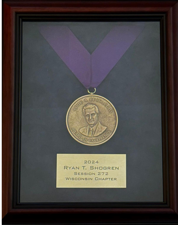
Livio Beccaccio Award