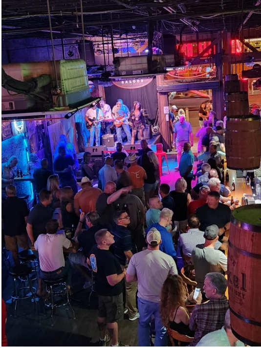
Monday Night Reception - Whiskey Bent Saloon