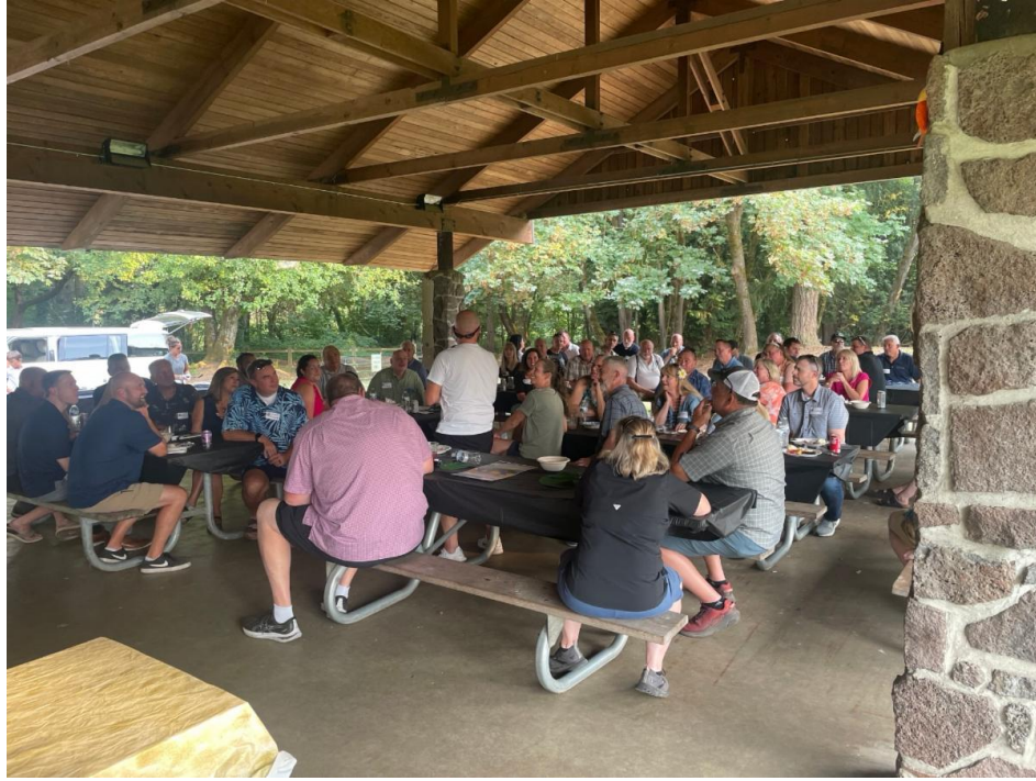
Oregon Chapter "Pig Out"