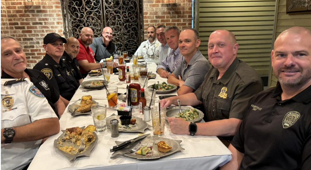
Networking Event with Session 292