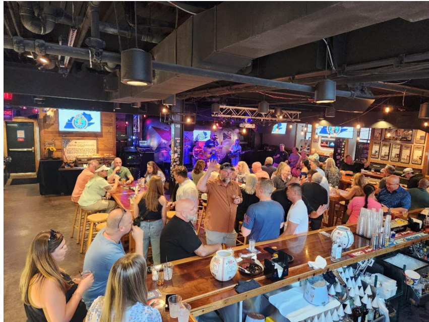
Monday Night Reception - Redneck Rivera