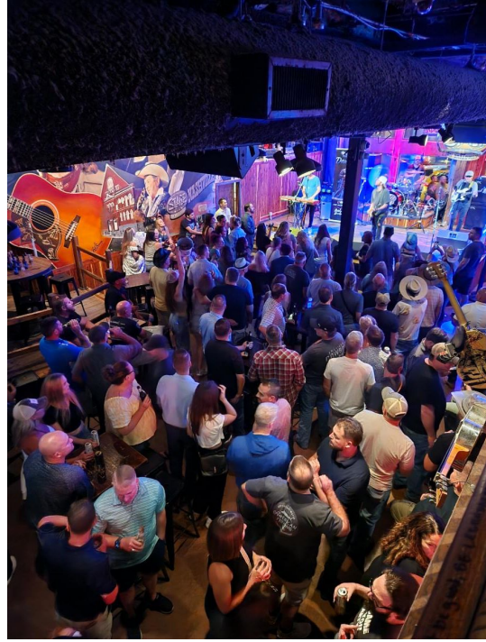
Tuesday Night Pub Crawl - Stage