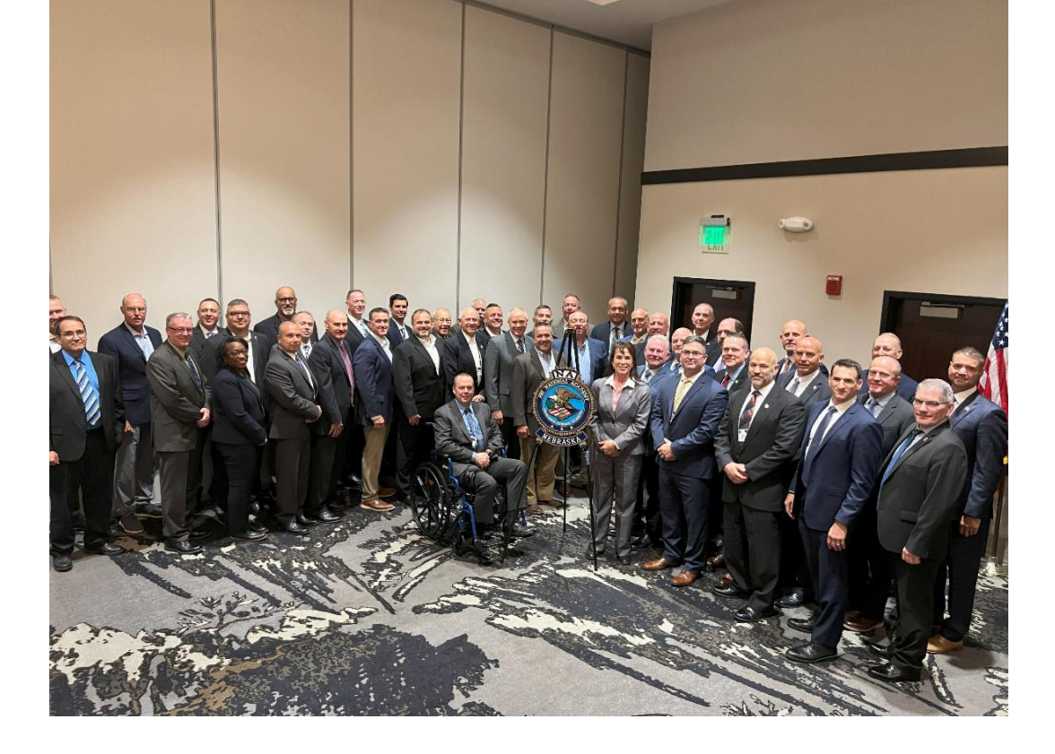
Nebraska Chapter Members attending the FBINAA Fall Training Conference

The Nebraska Chapter was well represented at this year's signature event, "The FBINAA Fall Conference" held in Kearney, Nebraska. From the Executive Leadership Committee thank you members, sponsors, and guest speakers for taking part in a very informative Fall Conference packed with training, equipment, and many professional networking opportunities.