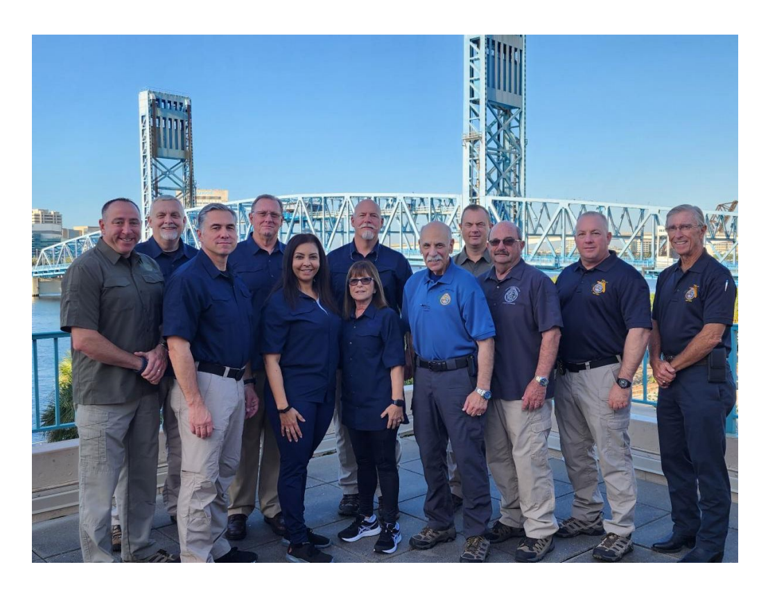
FBINAA Florida Chapter with Regional Representatives

On April 13th and 14th, the Florida Chapter Board and Regional Representatives met for a Board meeting in Jacksonville Florida.