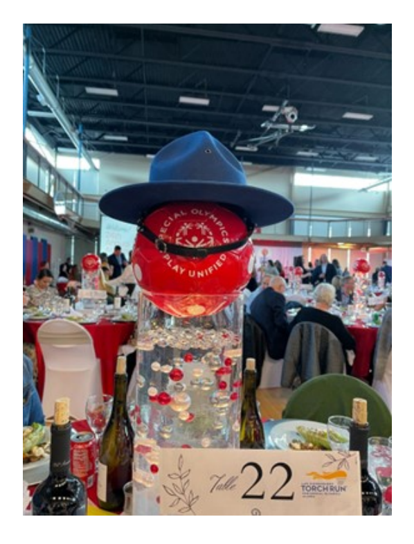
LETA Table with FBINAA Board