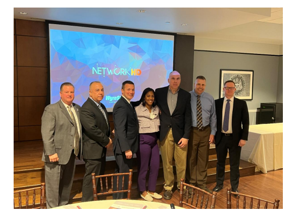
NA Session 284