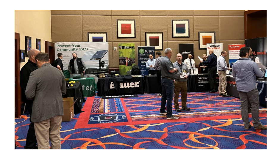
Vendor Exhibition at CT Chapter Regional Command College

The Connecticut Chapter hosted its first Regional Command College in March at the Mohegan Sun Resort and Conference Center. The event, attended by over one hundred law enforcement executives from the Northeast, provided top-notch training and networking opportunities. We look forward to next year's event.