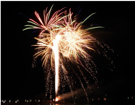
Fire and Ice fireworks display to wrap up the evening

The outing kicked off with a traditional Friday evening fish fry, followed by hospitality and networking. Saturday included a trolley ride to visit local Door County attractions. Saturday evening concluded with a meal, hospitality, an evening long visit by Green Bay Packer running back, A.J. Dillon, a door prize drawing, and fireworks show!