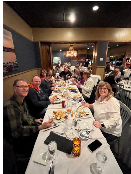
Friday Night Fish Fry

View this Edition and Past Editions on Our Website