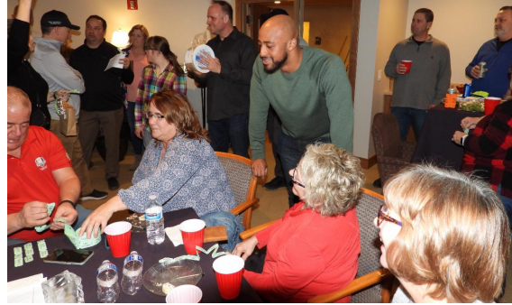
AJ Dillon, Green Bay Packer, visits Wisconsin FBINAA Winter Outing

The Wisconsin Chapter hosted their annual Family Winter Outing in beautiful Door County, WI the third weekend in February. The event was held in Sturgeon Bay with a combination of 55 NA grads and family members in attendance.