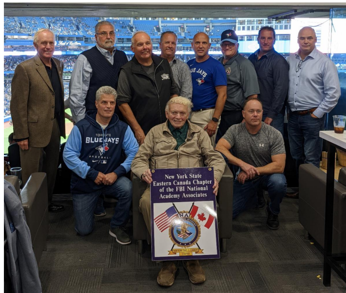
Toronto Blue Jays Game with New York/Eastern Canada Chapter