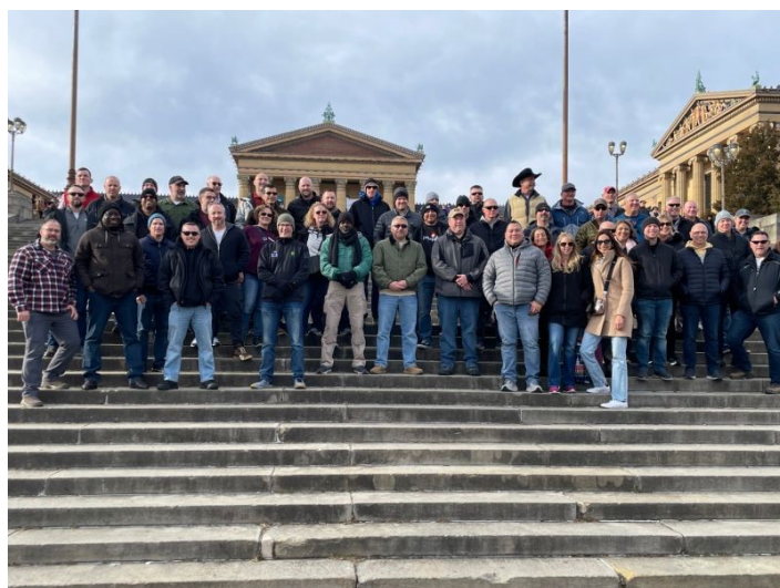
FBINAA Session 285 in Philadelphia