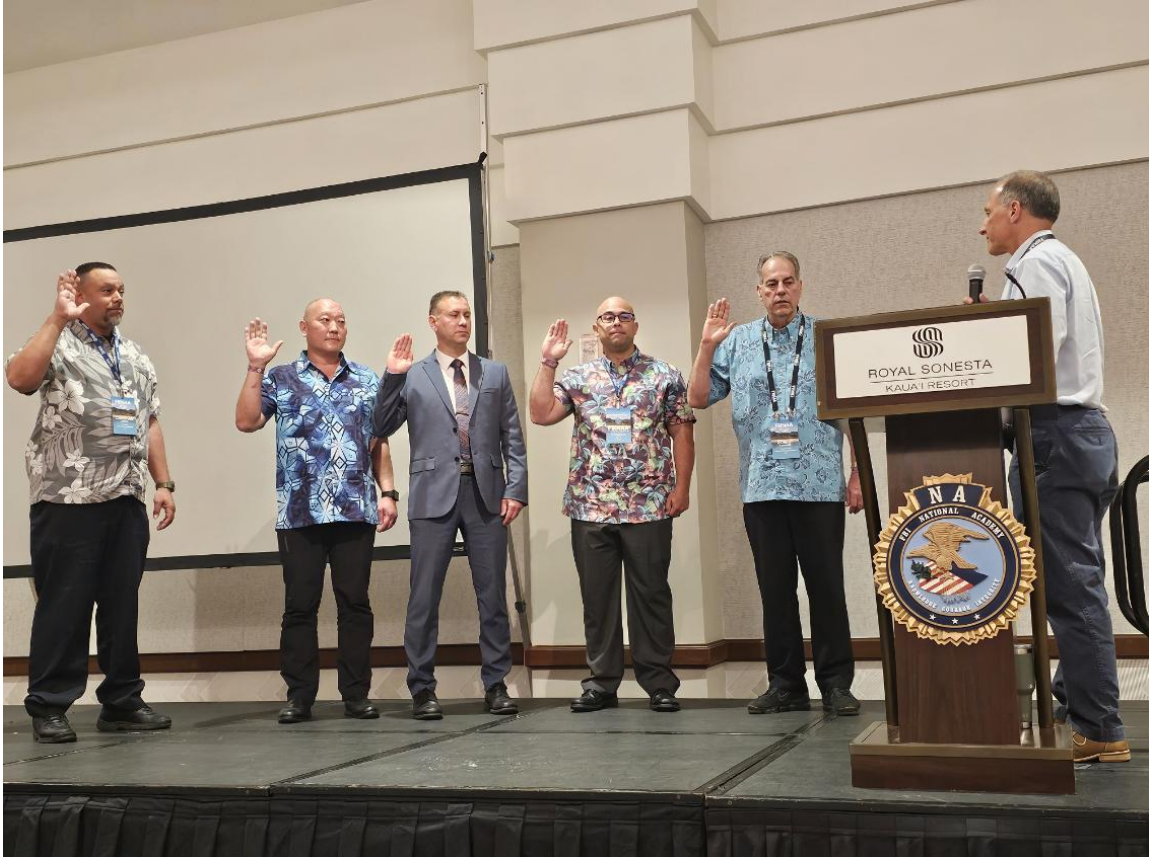
On stage photo of the Executive Board being sworn in by FBI SAC.