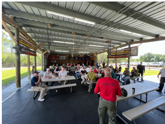
16th Annual Pistol Shoot/HR 218

On May 3rd, 2024, the 16th Annual Pistol Shoot/HR 218 event was held at the Saint Lucie County Sheriff's Office Sergeant Gary Morales Memorial Range in Fort Pierce Florida.