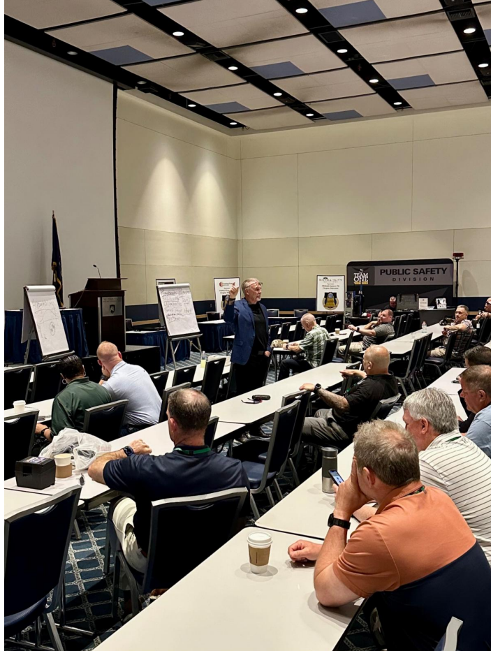
Eastern Pennsylvania Chapter Annual Retrainer