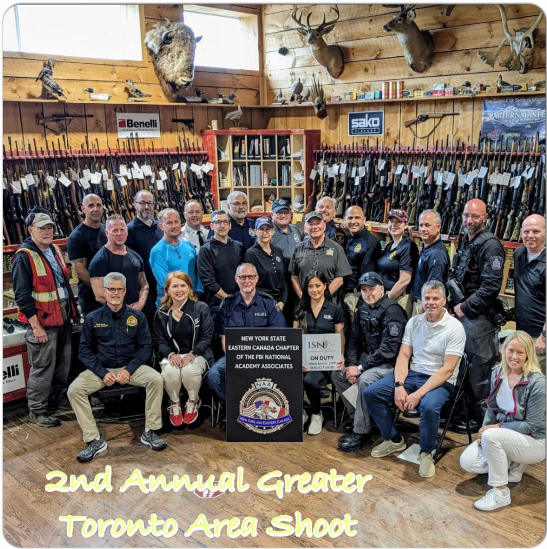
2nd Annual Greater Toronto Area Shoot