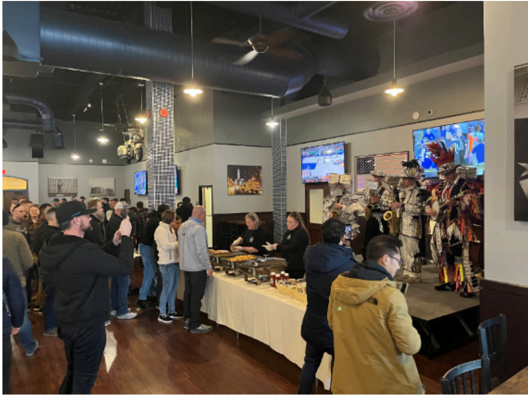
NA Session 293 Reception