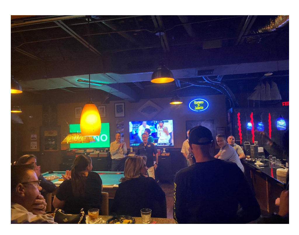
On March 21th, 2024 fellow members and guests had an evening of fellowship at Smoke on the Water in Weston, FL. Cigars, bourbon, and fine refreshments in a private room at the venue with bourbon for tasting and cigar purveyors on hand for sampling - a fun night for all.