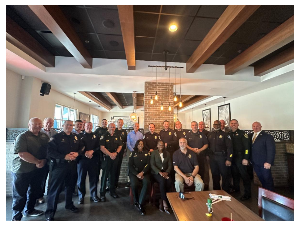
Members met at Senor Tequila's Mexican Grill on Monday, March 11th, 2024 for