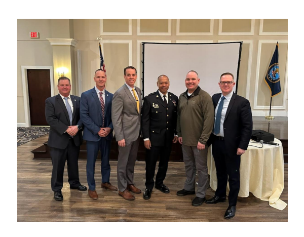
Session 288 Session 289