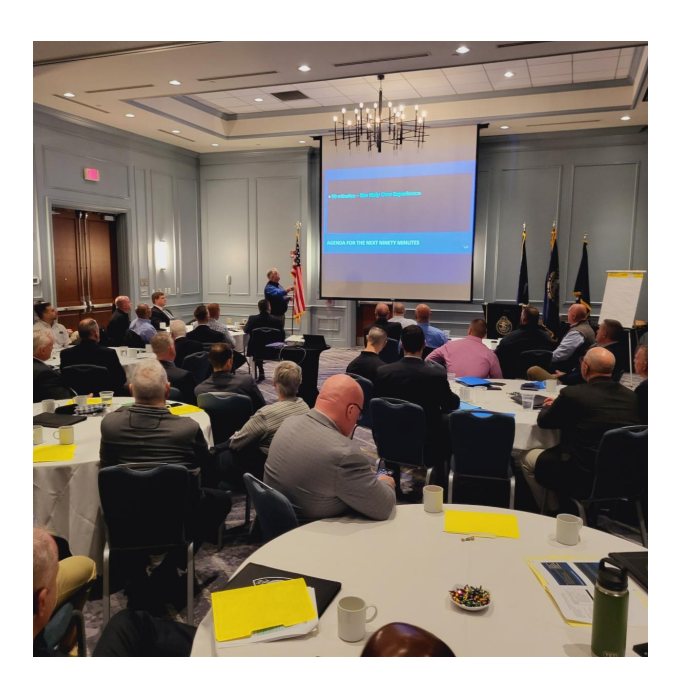
Chapter Meeting in Maine