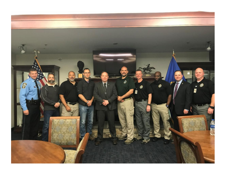
Virginia Chapter Board with Session 285

Members of the FBI NA Virginia Chapter Board visited Quantico on March 2, 2023 to have dinner and fellowship with the Virginia members of Session 285. It is always a great experience to interact with the current session and it gives past attendees a chance reminiscence. Best of luck to you all!